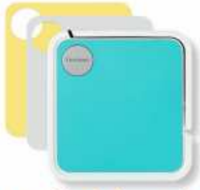
Swappable Coloured Plate