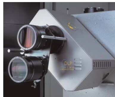
Unique, dust-proof digital head with twin anamorphic lens attachment

Electronic masking left, right, top and bottom. Independent left and right keystone correction. Correction of keystone distortion in up to 15% down or side angle