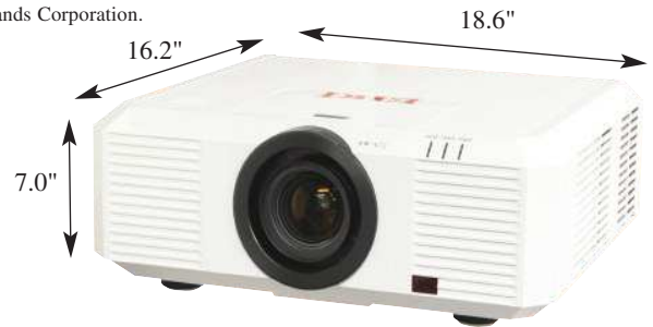
EK-510U • WUXGA • 3LCD projector. EK-511W • WXGA • 3LCD projector.