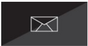
Email alerts and instant notifications - help desk requests, service reminders, device failure or theft