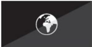
Global monitoring of all AV devices

Multiple ZU510T's can be monitored over LAN and also provide the user with an email message alert in case an error occurs or a light source fails or needs to be replaced, using Crestron RoomView. While the web browser interface and full support for Extron's IP Link, AMX dynamic device discovery and PJ-Link protocols, allow almost all aspects of the ZU510T to be controlled across a network, keeping you in control, wherever you are.