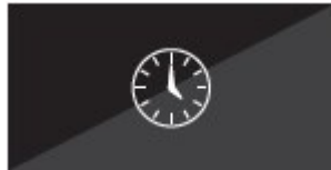
Track projector light source usage