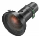
VPLL-Z3009 Short focus zoom lens