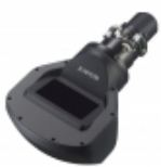
VPLL-3003 Projection Lens for the VPL-F Series