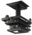
PSS-650 Projector Ceiling Bracket for Installation