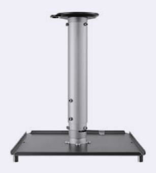
Ceiling Mount: 5J.JCY10.001