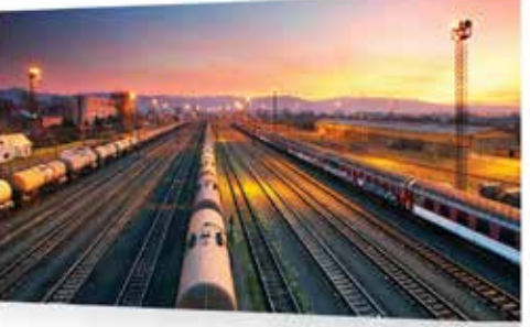
View the best possible images