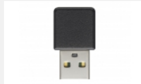
IFU-WLM3 USB wireless LAN module