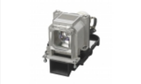
LMP-E221 Replacement Lamp for the VPL-E300 Series