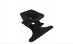
PAM-210 Projector Ceiling Mount for Installation Projector