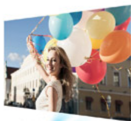
Conventional projectors offer low-quality images