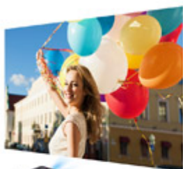
SuperColor™ projectors offer color accuracy levels

ViewSonic's proprietary SuperColor™ Technology offers a wider color range than conventional DLP projectors, ensuring that users enjoy more realistic and accurate colors. With an exclusive color wheel design and dynamic lamp control capabilities, SuperColor™ Technology projects images with reliable and true-to-life color performance, in both bright and dark environments, without sacrificing image quality.