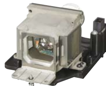
LMP-E212 Projector Lamp (for replacement)

© 2011 Sony Corporation. All rights reserved. Reproduction in whole or in part without permission is prohibited. Features and specifications are subject to change without notice. All non-metric weights and measurements are approximate. Sony and make.believe are trademarks of Sony Corporation. All other trademarks are the property of their respective owners.