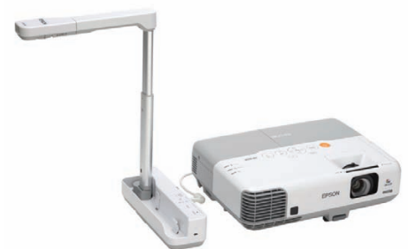
Share 3D objects using the ELP-DC06 document camera